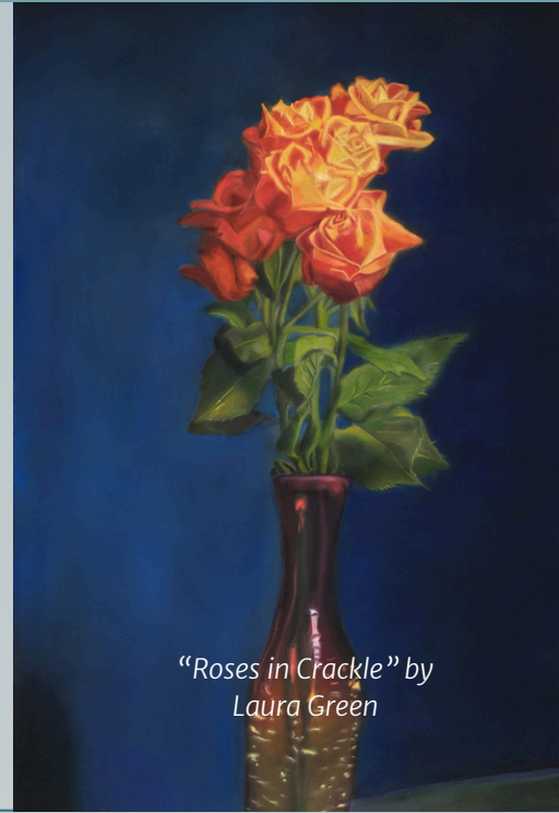
“Roses in Crackle” by Laura Green

In 2025, we have introduced the RISE Together Gala , an exclusive event for dedicated supporters of The Blue Bench to witness the exhibit before it opens to the public.